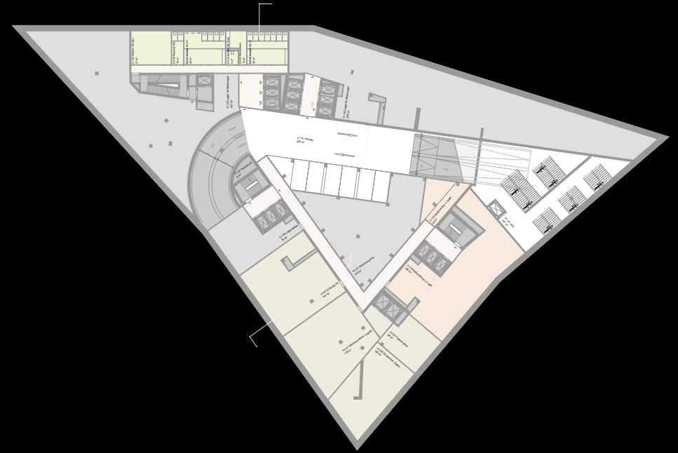
Grundriss 1.Untergeschoss M. 1.200