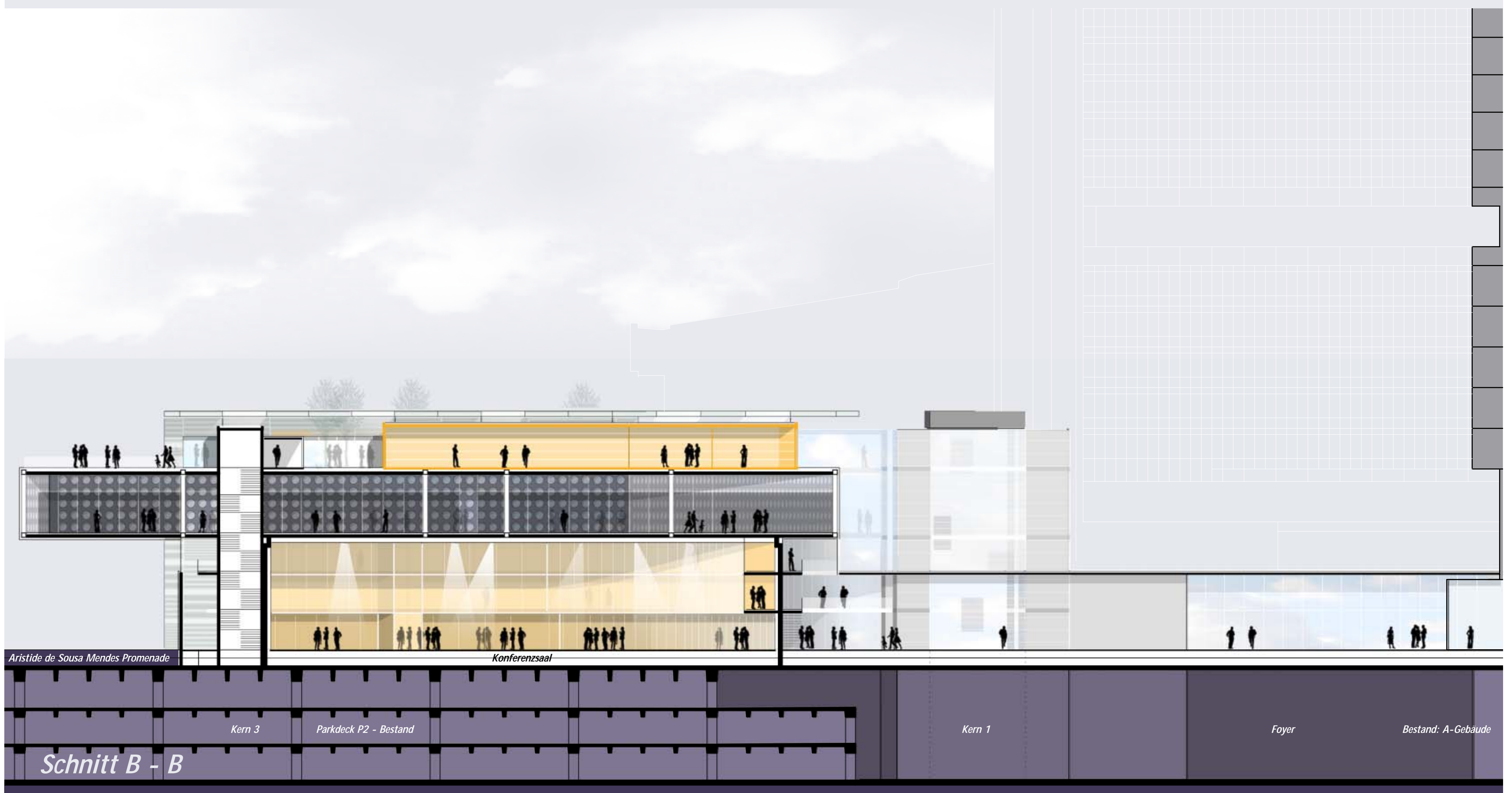
Schnitt B - B